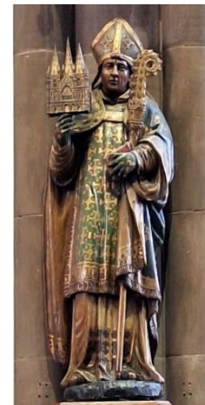
Image of St. Chad from St. Chad's cathedral

In 1841 St. Chad's bones were placed in the first new Catholic cathedral to be built since the Reformation in Birmingham, which was dedicated to St. Chad, and they are still there in a beautiful casket.